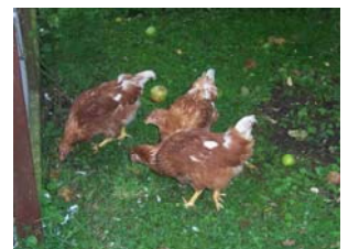
All grown up 3 months later