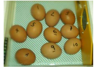
As eggs day 1