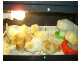
All our fluffy little chicks