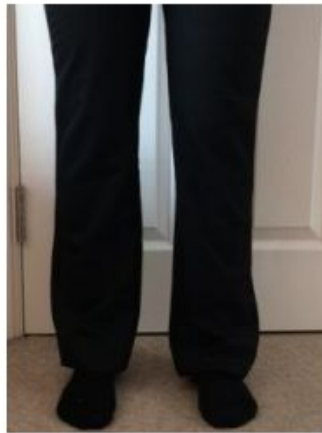
Boot cut – acceptable