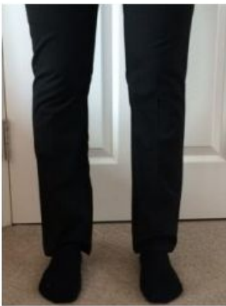
Slim fit - acceptable

Illustration of styles that are acceptable and not acceptable: