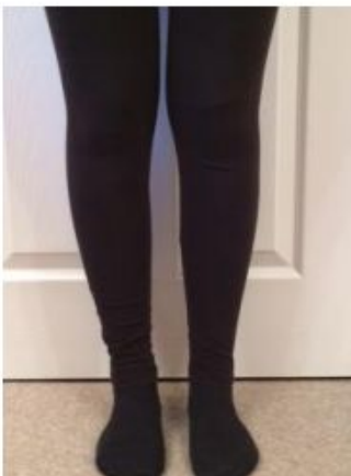
Skinny fit – not acceptable