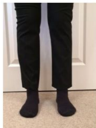
Not full length – not acceptable