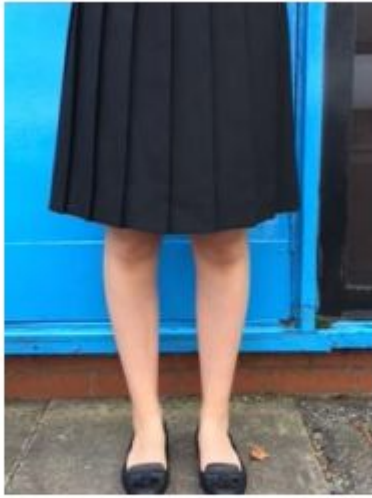
Acceptable length (a bit shorter or longer is also acceptable)

Skirts are a regulation item and must therefore only be purchased from the school's approved supplier. Only a black Trutex senior stitch down pleat skirt may be worn to school. The skirt must be no shorter than 5cms above the knee.