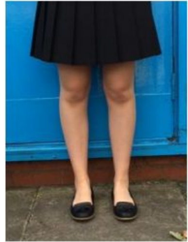
Too short – not acceptable