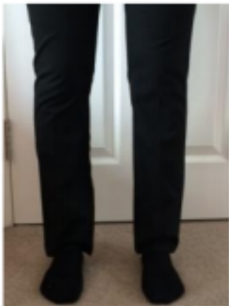
Slim fit - acceptable

Illustration of styles that are acceptable and not acceptable: